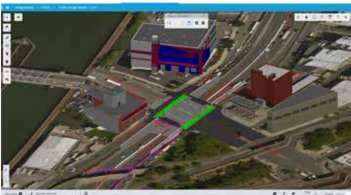
Using iTwin Design Review provided an integrated digital environment for more than 180 reviewers across 15 agencies to optimize design review and change management.

familiar with Bentley applications, NYSDOT selected OpenBridge Modeler, ProSteel, and MicroStation to develop a 3D model of the entire bridge structure to a level of detail that contractually enabled the team to build directly from the model, without requiring the aid of a complete set of 2D plans. The interoperability of Bentley's modeling software enabled NYSDOT to directly reference the highway designers' OpenRoads alignment file in the 3D bridge model, ensuring positional accuracy. Integrating iTwin Design Review to the project allowed more than 180 reviewers across 15 agencies to easily access and comment on the model in a digital environment.